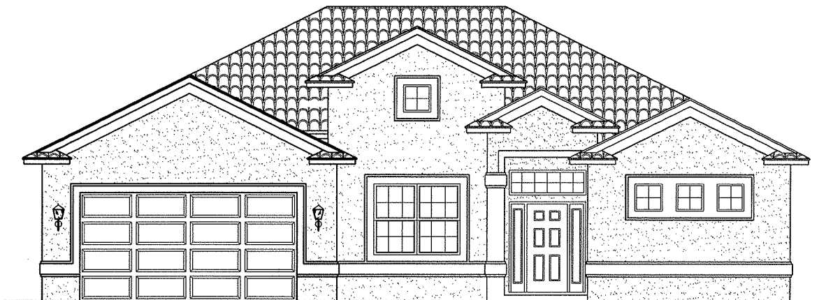
FRONT ELEVATION 'B'

TREND HOMES RESERVES THE RIGHT TO MAKE MODIFICATIONS TO FLOOR PLANS, MATERIALS, AND SPECIFICATIONS WITHOUT NOTICE. DIMENSIONS ARE APPROXIMATE. ILLUSTRATIONS ARE ARTIST RENDERINGS ONLY. THIS IS A CONCEPT DRAWING.