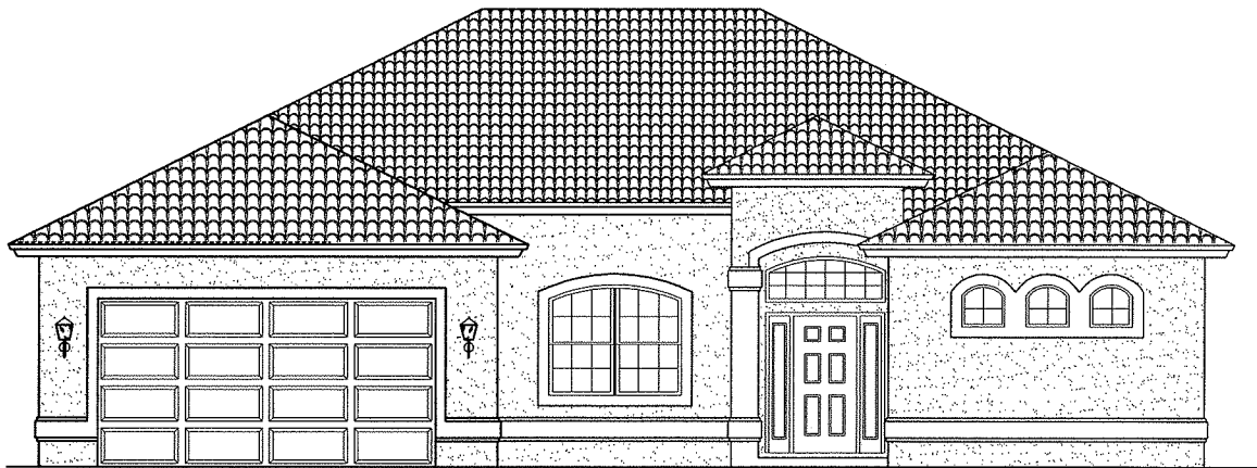
FRONT ELEVATION 'A'